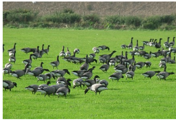
Above: (Before) A field full of Canadian Geese.