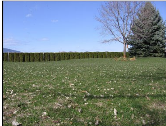
Below: (After) A field full of Canadian Geese feces.