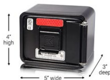
KnoxBox® 3200 Standard Capacity ⓘ

Specific Knox Box Models allowed for installation are as follows: