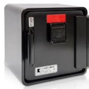
KnoxVault® 4400 Maximum Capacity ⓘ