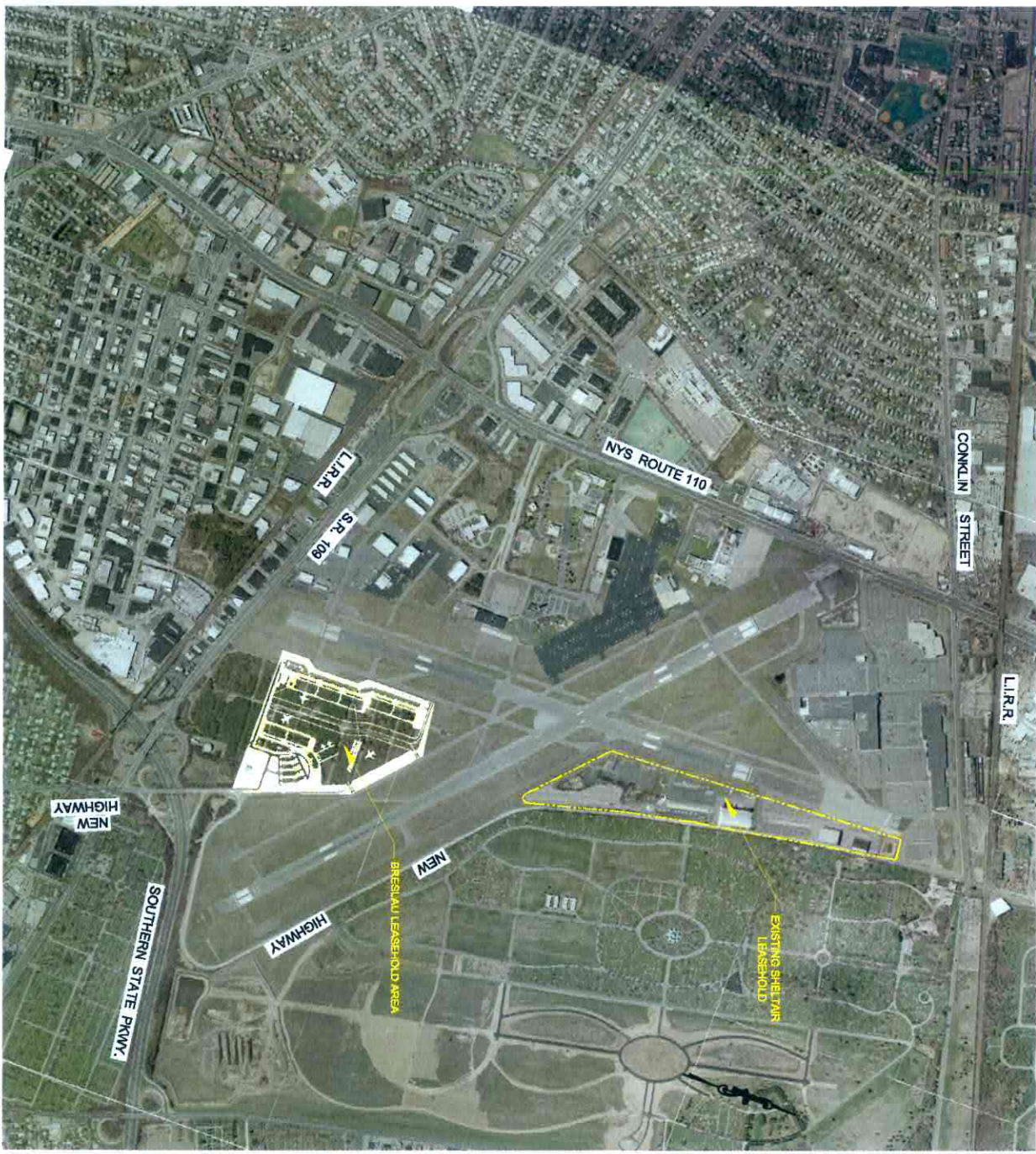
FIGURE 2 LOCATION MAP